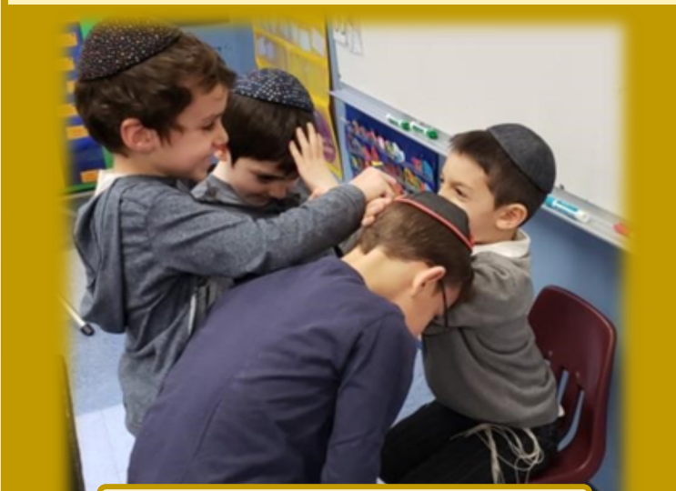
Parsha Comes Alive In Pre-1A