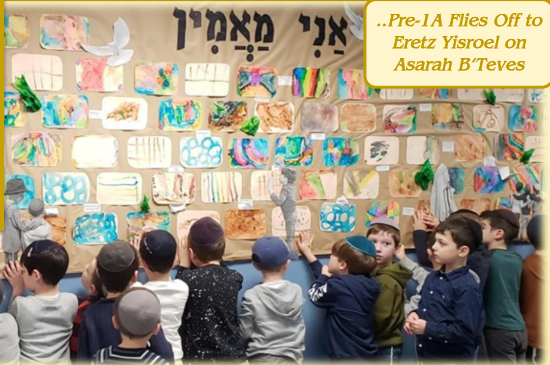
..Pre-1A Flies Off to Eretz Yisroel on Asarah B'Teves