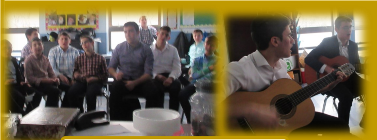
Kumzitz in the Eighth Grade