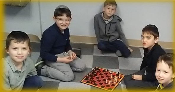
Second Graders Sharpening Their Mental Acumen with Chess During Recess