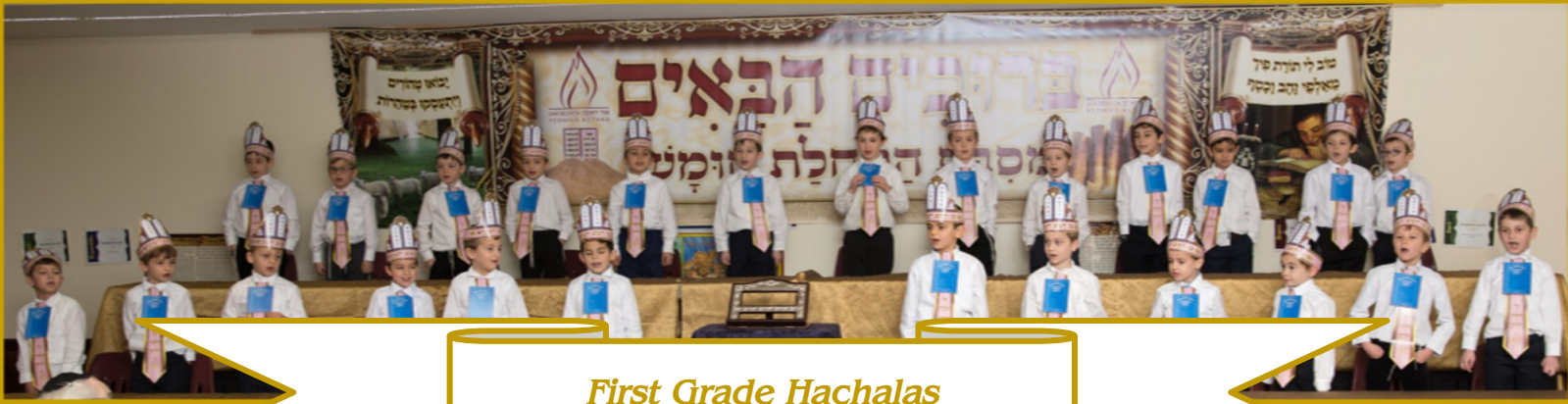
First Grade Hachalas Chumash Celebration