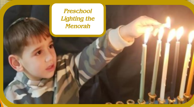
Preschool Lighting the Menorah