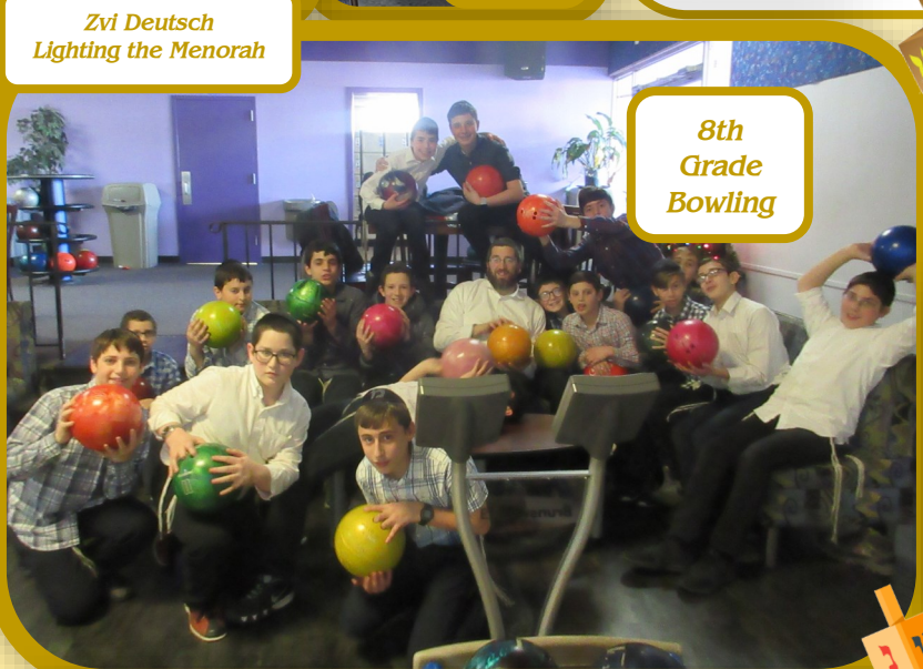
8th Grade Bowling