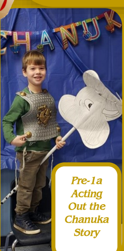
Pre-1a Acting Out the Chanuka Story