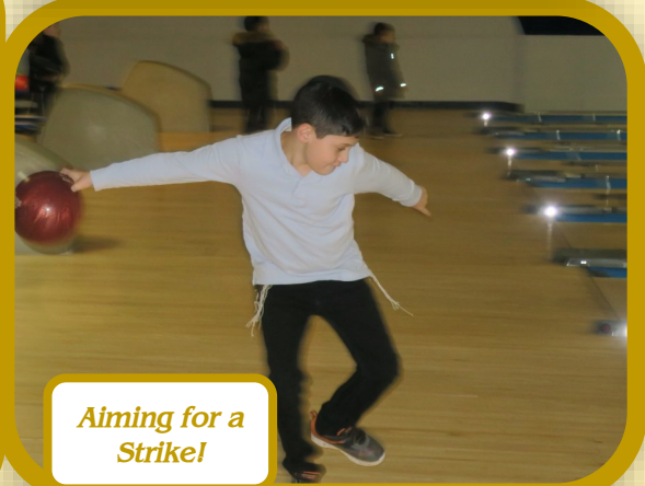
Aiming for a Strike!