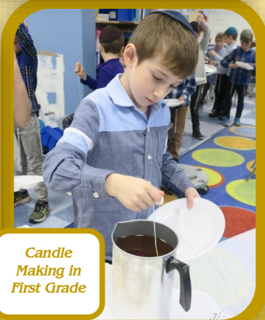
Candle Making in First Grade