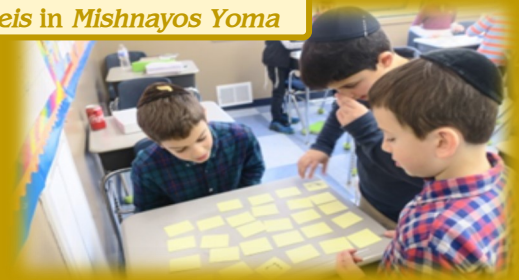
Playing a Memory Game Designed for Practicing Mishnayos