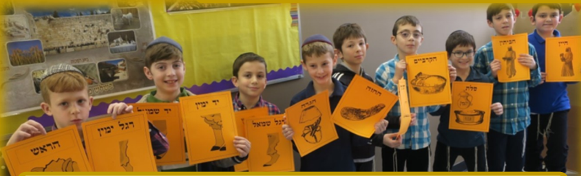
Visualizing How Raffles Worked and How Parts Were Split Amongst Kohanim in the Beis Hamikdash