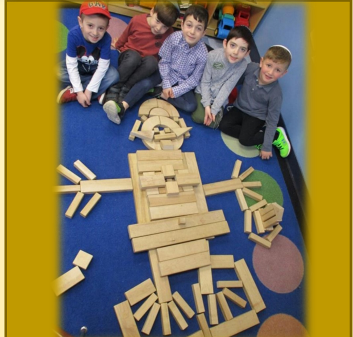
Teamwork by our Pre 1A