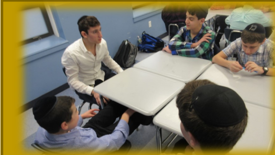
Weekly Parsha Chaburas Delivered by 12th Graders to 8th Graders