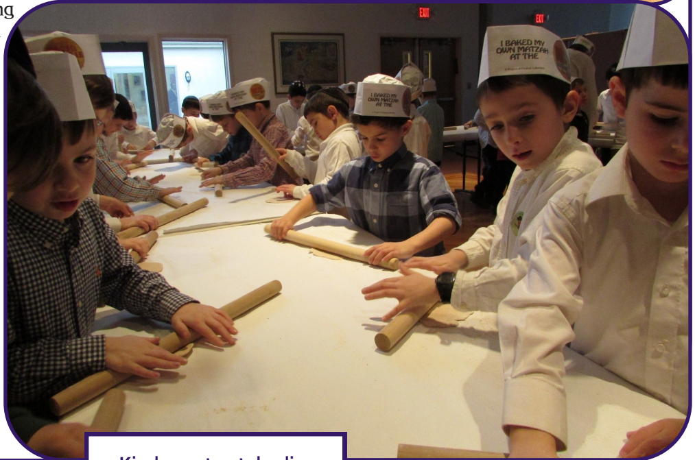
Kindergarten talmdim learning Alef Beis