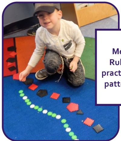
Meir Rubin practicing patterns