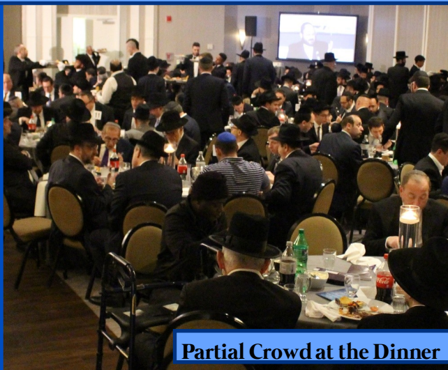
Partial Crowd at the Dinner