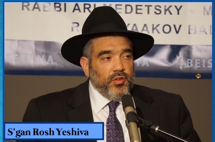
S'gan Rosh Yeshiva