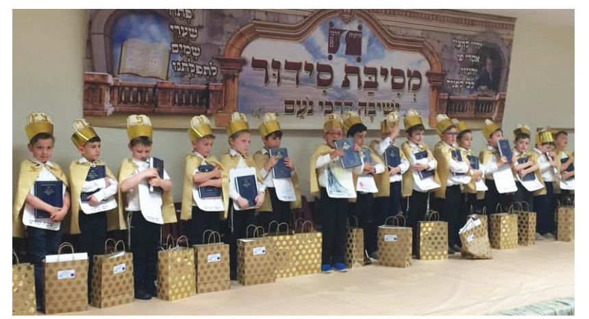
Yeshiva Darchei Noam, Pre-1A siddur party.