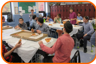
8th graders enjoying pizza to celebrate the first full days of Station Rotation

Station Rotation!! With the installation of "Office 365" on the talmidim's laptops in the Rabbi Plotzker's seventh grade and other grades too, we now are able to begin implementing the Station Rotation educational model, which has been successful in other classes. The class is divided into three groups, with each group being given a different task to do individually. One group reviews the punctuation, highlighting milim , while the other group reviews the niggun , translation, and explanation of the gemara , while Rebbe learns with the third group. The great part is that each small group separately gets a chance to learn with Rebbe before reviewing the gemara collectively together.