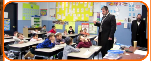
Rosh Hayeshiva's visit to 1st grade in honor of the haschalos chumash