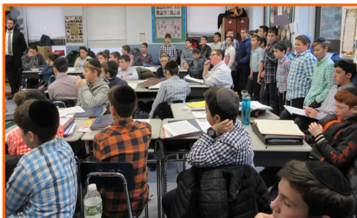
The Rosh Hayeshiva giving a hesped on Rav Shteiman zt"l to the 7th & 8th grade talmidim