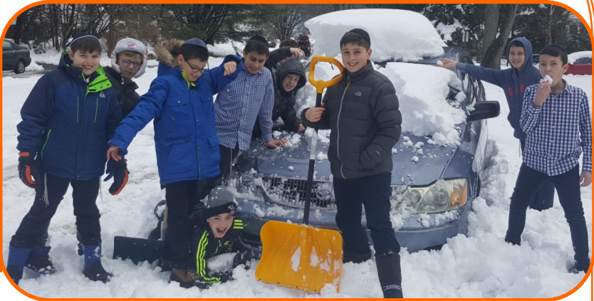
Talmidim shoveling out cars during recess at Rabbi Senter's shul

Power down? The atmosphere at YKOR was definitely up! Last week, despite the fact that the classrooms were darker than usual, all of the talmidim who walked into the yeshiva were ready to learn with their usual enthusiasm. Then the shades in each classroom were pulled up to get the most natural light possible from outside as the boys were ready to forge ahead creating their own electric atmosphere. The power in yeshiva might have been down, but no one would have noticed given how the learning by our undaunted talmidim was definitely more than up to par.