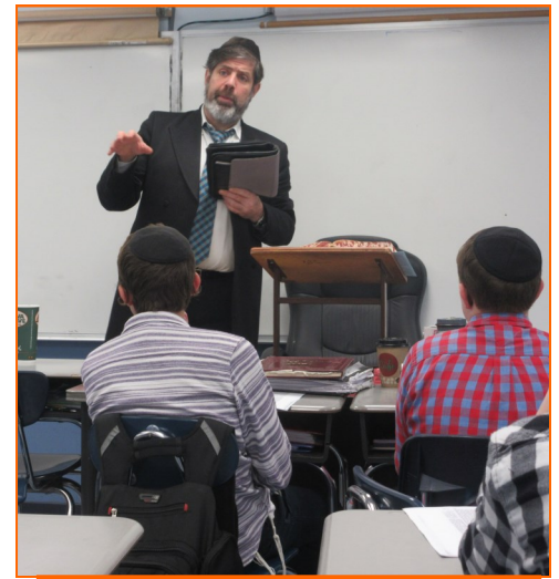
The Rosh Hayeshiva speaking to the 8th grade talmidim

In Theodore Boone, the Activiist , one of Theo's character traits is confidence. A scene in the story that shows this is when a debate took place. When it was Theo's turn to speak, he walked up with confidence, spoke slowly and clearly. Although he had notes, he chose not to look at them.