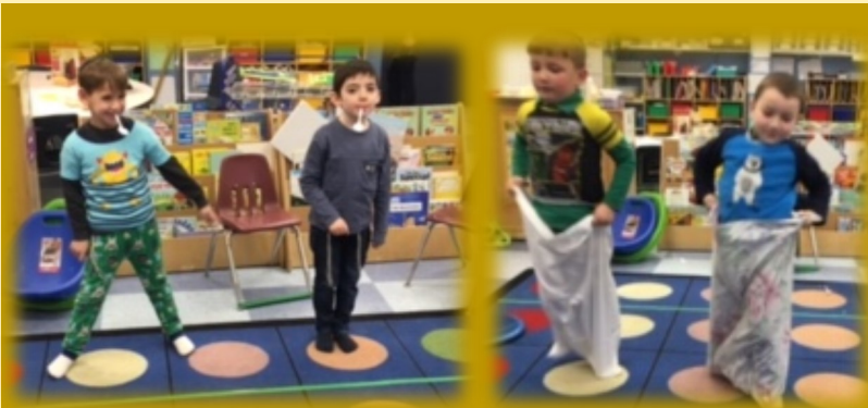
Pre-1A students enjoying a Pajama Party for the letter "P."