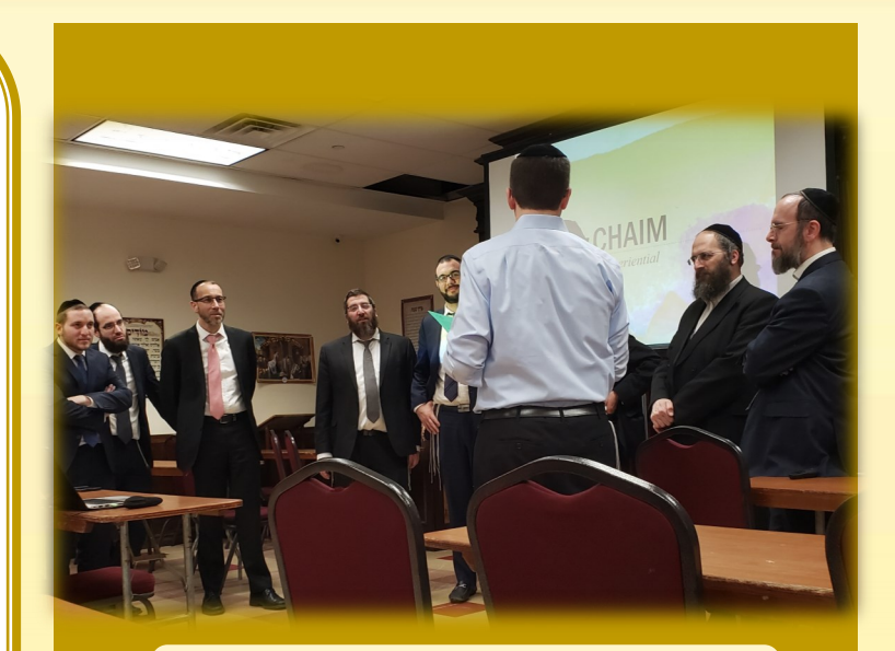
NHA Teachers Workshop Monday, Feb. 18

המקום ינחם אתכם בתוך שאר אבלי ציון וירושלים May Hashem comfort you among the mourners of Tzion and Jerusalem. May the family only know of Simchos!