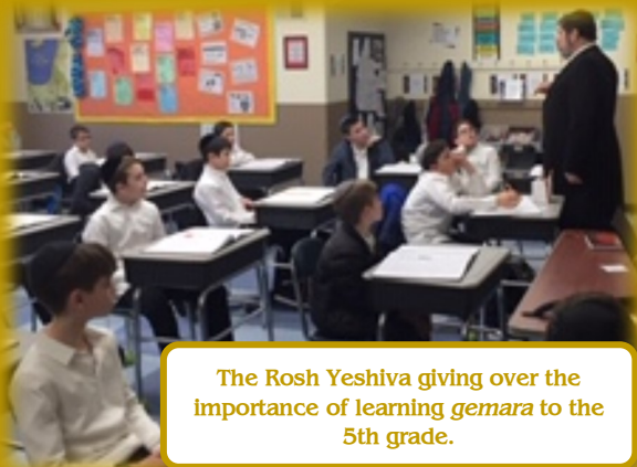
The Rosh Yeshiva giving over the importance of learning gemara to the 5th grade.