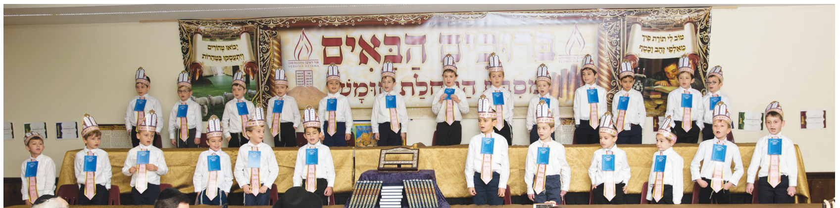
Yeshiva Ketana Ohr Reuven’s first-grade has’chalas Chumash celebration.