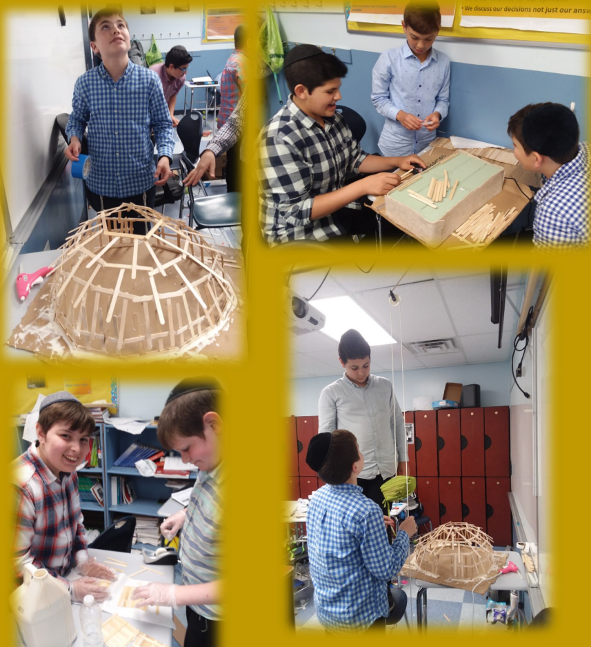
Working hard preparing for the Project Based Learning Fair. Come and see the finished products displayed at the fair! Grades 6-8