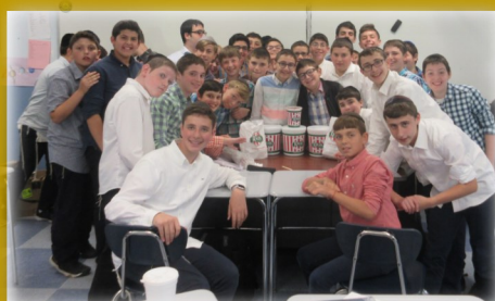
Eighth grade enjoying their reward from Masmidei Hasiyum