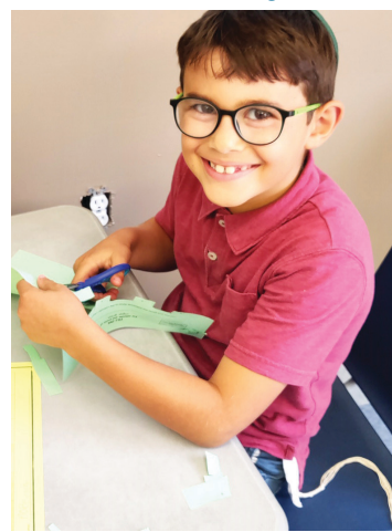
3rd Grade Working on their Tishrei Calendar Project.