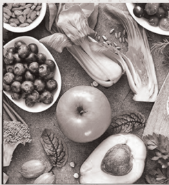
DIET FANTASY GIFT CERTIFICATE