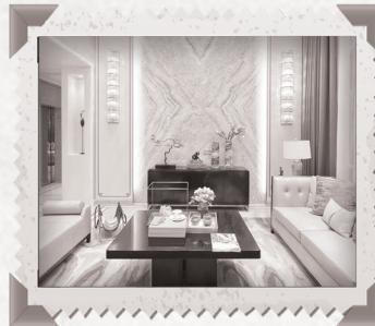
10 HR INTERIOR DESIGN SERVICES BY RUCHI PARISER