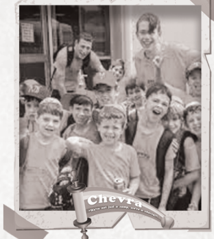
FULL SUMMER AT CAMP CHEVRA FOR ONE CAMPER