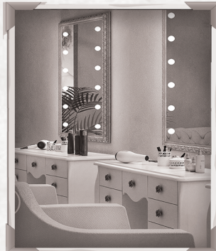
SHEITEL BY DENA APPEL