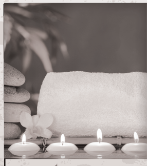
SPA PACKAGE AT POWDER & PAINT