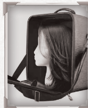
WOMEN'S WIG PACKAGE