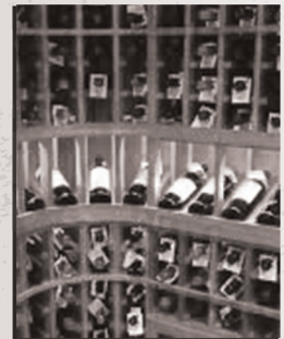
WINE PACKAGE +$250 AT FIRESIDE

SPLIT THE POT -$5 1 TICKET -$10 11 TICKETS -$100 24 TICKETS -$200 48 TICKETS -$360