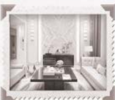
10 HR INTERIOR DESIGN SERVICES BY RUCHI PARISER