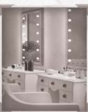
SHEITEL BY DENA APPEL