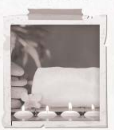
SPA PACKAGE AT POWDER & PAINT