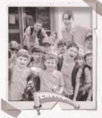
FULL SUMMER AT CAMP CHEVRA FOR ONE CAMPER