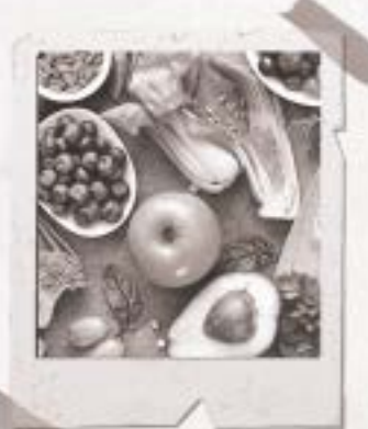
DIET FANTASY GIFT CERTIFICATE