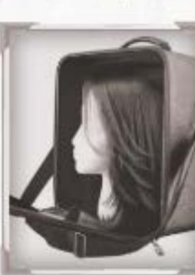
WOMEN'S WIG PACKAGE