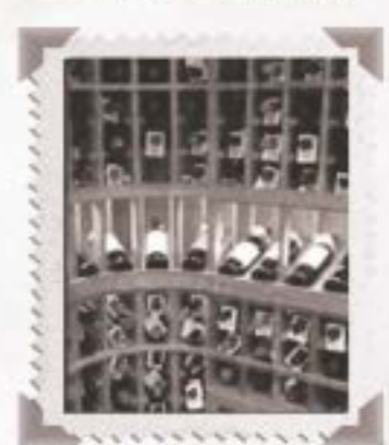
WINE PACKAGE +$250 AT FIRESIDE

SPLIT THE POT -$5 1 TICKET -$10 11 TICKETS -$100 24 TICKETS -$200 48 TICKETS -$360