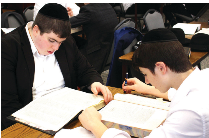
The talmidei HaMesivta undergo an intense bechina process during Chanukah. Pictured above are Yeshiva bochurim chazering for their upcoming bechina!