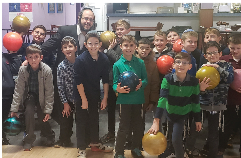
Chanukah bowling trip sponsored by the N'shei!