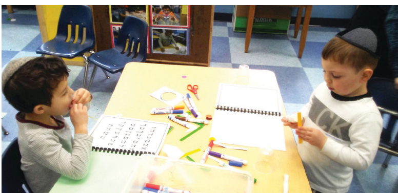
The kindergarten class decorating their Alef Bais books!

Registration is now open for the Mad Science and Chess Wizards after-school program Winter Sessions!