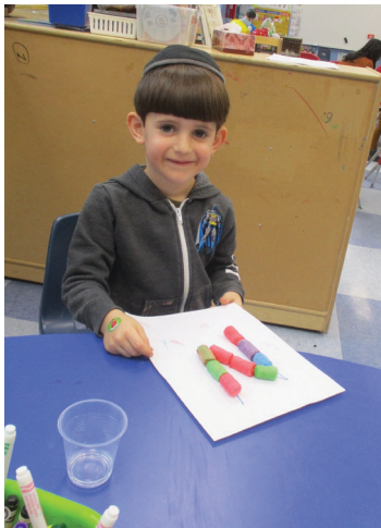
The Pre-1A class learnt about the letter "N" and used magic noodles to form the letter "N"!