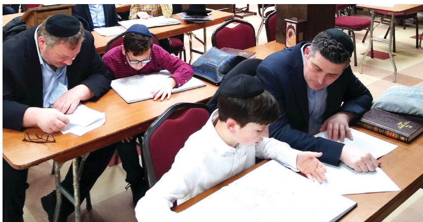
7th grade father and son siyum this past Sunday!