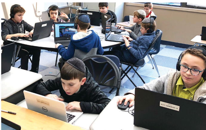
Our 4th graders hard at work in our mobile computer lab.