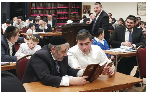
Talmidim, Fathers and Zaidies at the 5th grade's Hascholas Gemara Event!