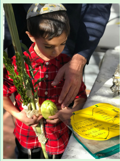
Some of Yeshiva Ketana talmidim celebrating zman simchaseinu with a smile!!

(if you would like to and didn't not yet send in a picture, please email to <u>pictures@ohrreuv</u> <u>en.com</u>)