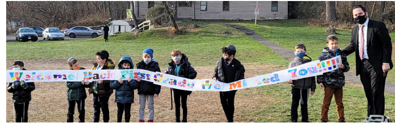
2nd Grade welcoming the 1st grade back from quarantine!