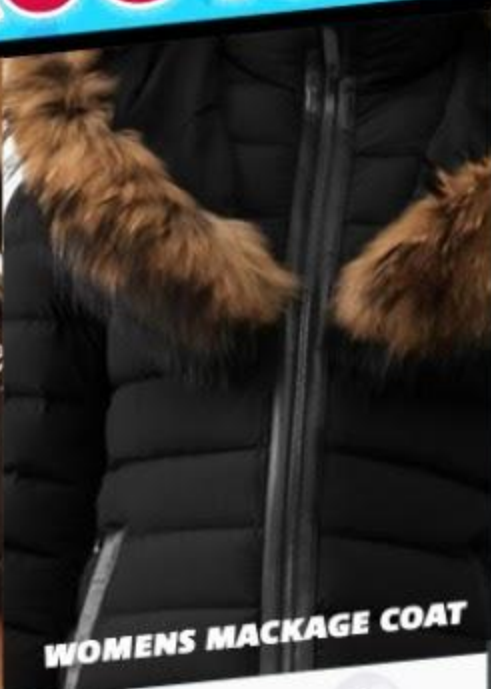
WOMENS MACKAGE COAT