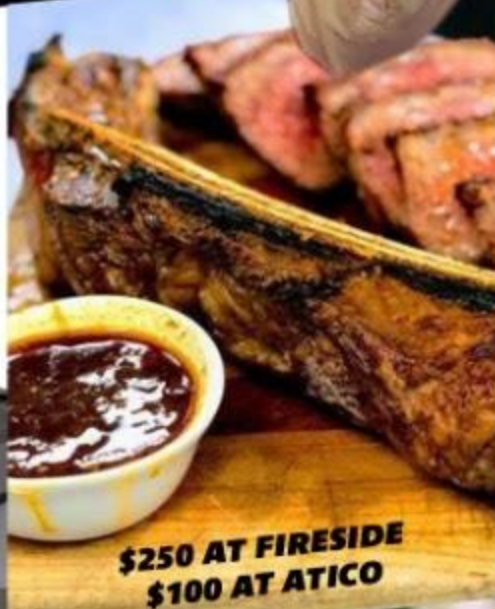
$250 AT FIRESIDE $100 AT ATICO