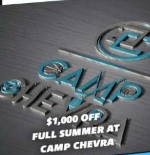
$1,000 OFF FULL SUMMER AT CAMP CHEVRA