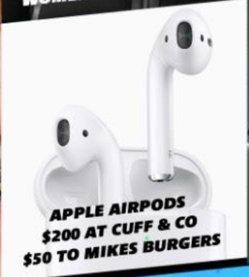
APPLE AIRPODS $200 AT CUFF & CO $50 TO MIKES BURGERS