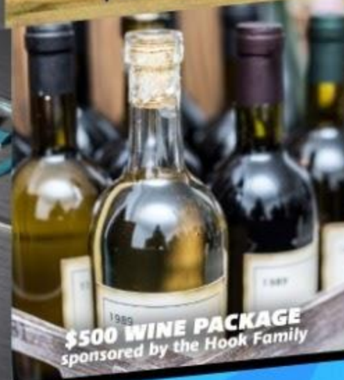
$500 WINE PACKAGE sponsored by the Hook Family