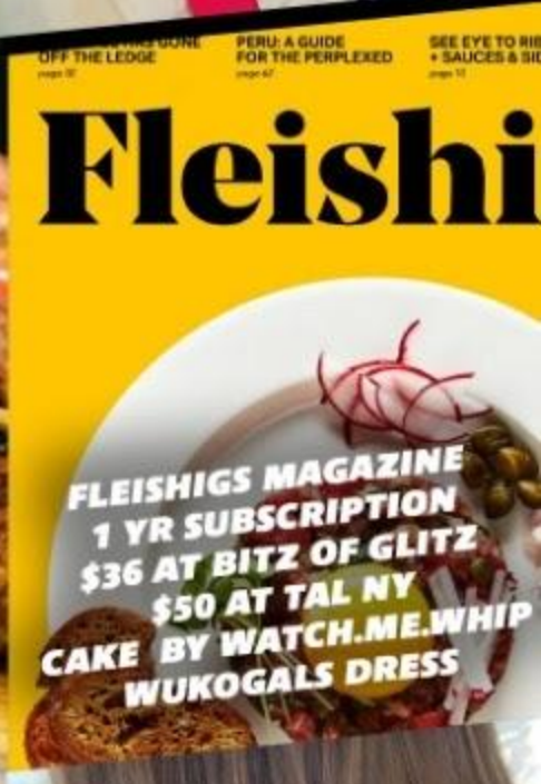
FLEISHIGS MAGAZINE 1 YR SUBSCRIPTION $36 AT BITZ OF GLITZ $50 AT TAL NY CAKE BY WATCH.ME.WHIP WUKOGALS DRESS