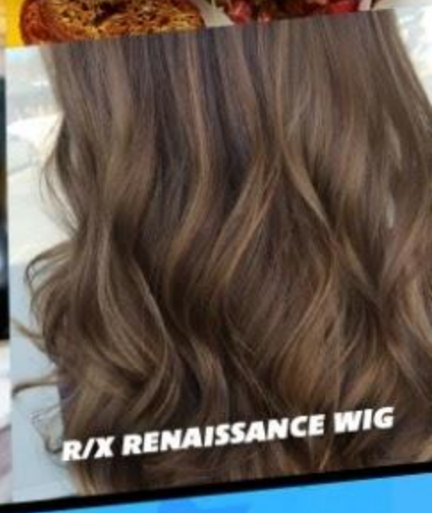
R/X RENAISSANCE WIG

*all images are for illustrative purposes only, see details on online form