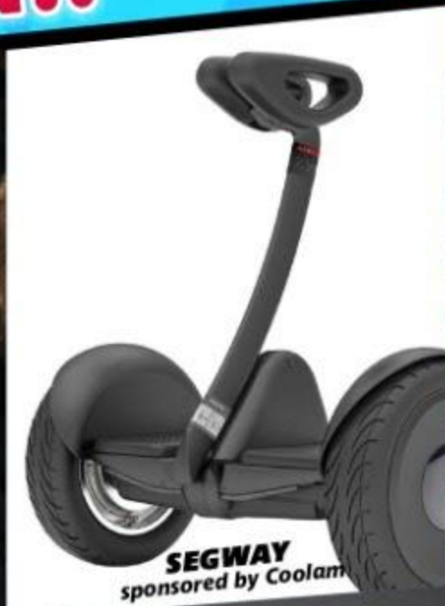
SEGWAY sponsored by Coolam