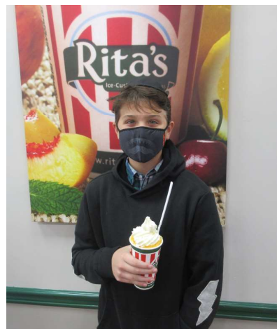
Winners of the 8th Grade Gemara Song Contest enjoy a trip to Rita's!