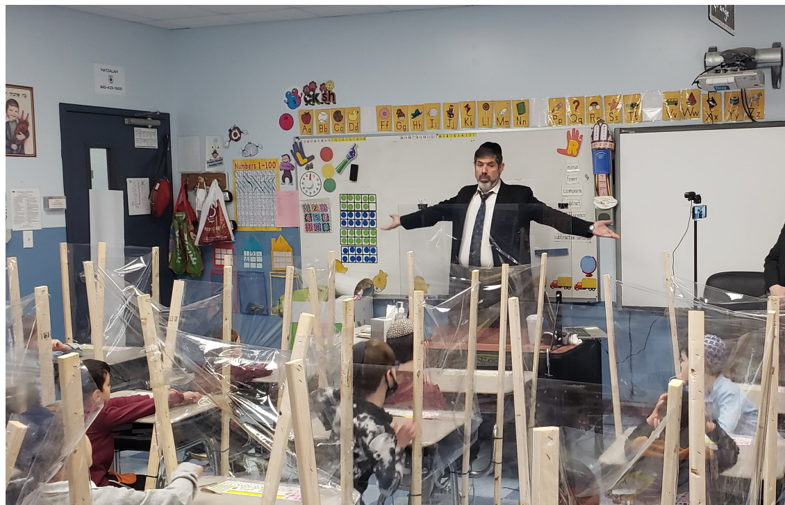
Rosh HaYeshiva Visited the 1st Grade, in Honor of the Hascholas Chumash!