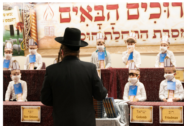
1st grades Haschulas Chumash!