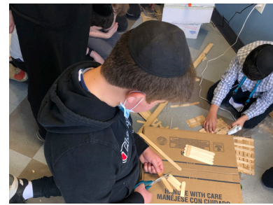
Project Based Learning in Action!