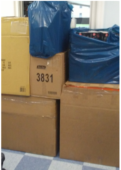
Raffle Prices have arrived! They will be distributed next week.