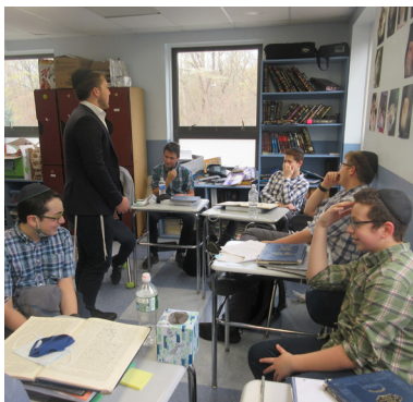
12th graders giving parsha chaburah to 8th graders!