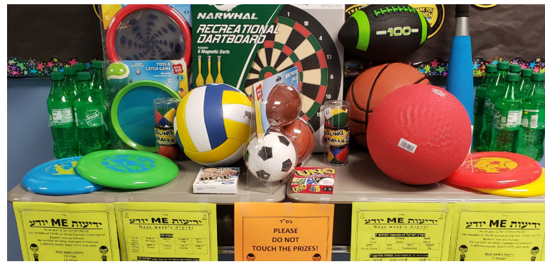
Prizes for the upcoming yedios ME yodea raffles!