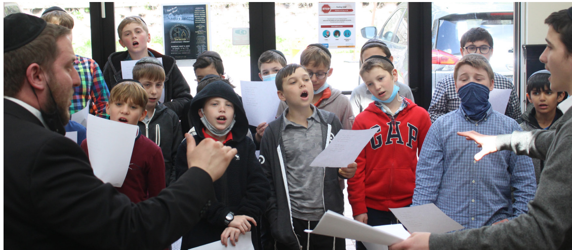
Choir in practice ... gearing up for the Yeshiva's Annual Dinner this Sunday!