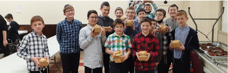
Davening program breakfast special for grades 6th-8th!