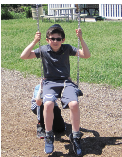
2nd and 3rd graders had a grand time at the Ruach Hachaim Park in Monroe. They enjoyed all the exotic and exciting playground activities!