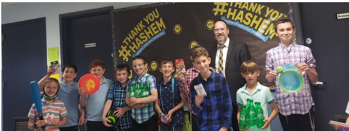
Winners of the yedios me yodea raffle!

259 Grandview Avenue Suffern, NY 10901 845.362.8362 www.ohrreuven.com