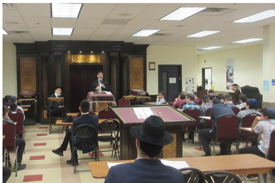
The Rosh HaYeshiva Addressing the Talmidim!