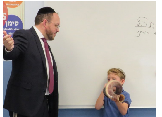
Talmidim of Rabbi Lowy's 4th grade blowing the shofar!