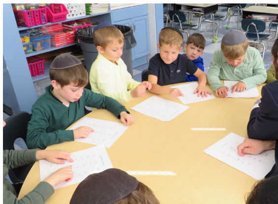
1st graders during Kriah station rotation.