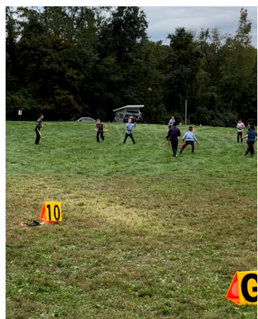
Recess Leagues - Flag Football.