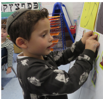
Kindergarten learning about their emotions- "sunny" & "cloudy" feelings.