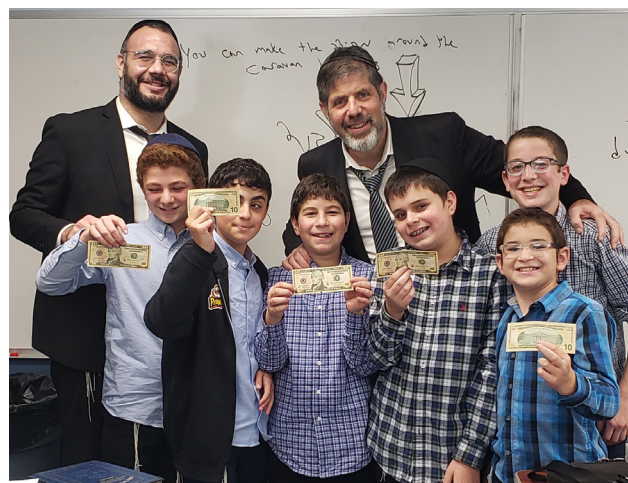
Our Rosh Yeshiva taking pride in some of the talmidim who participated in the "Sleeping in the Sukkah Program"!