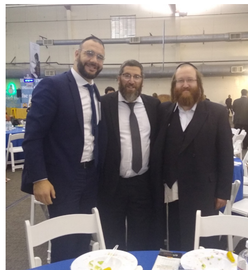
Some of our rabbeim at the convention!