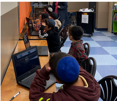
Computers in grades 3 and 4.