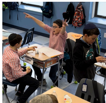
6th graders testing monocular vs binocular vision.