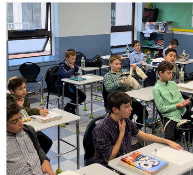
7th graders measuring their pulse rate before and after exercise.

PLEASE SHARE WITH US! Please email any Mazel Tov information to reuveenreview@ohrreuven.com !