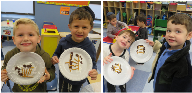
In honor of Parshas Vayeitzei, our kindergarten boys created an edible ladder and 12 stones, using pretzels, marshmallow fluff and chocolate fluff! Delicious!