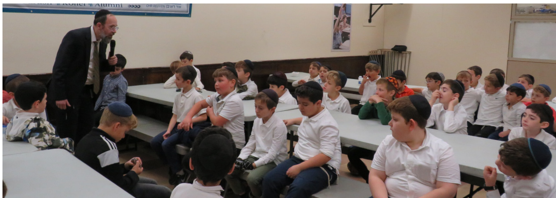
Last Friday's Matnas Shabbos!