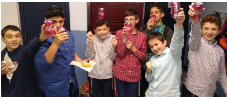
The winning team of a 7th grade Chazarah Bounceketball Tournament celebrating their victory!