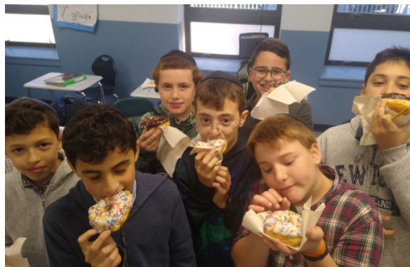
Thank you to our N'shei for the yummy Rosh Chodesh treat!

There is Mincha on Sundays in the Yeshiva Ketana Ohr Reuven Beis Midrash at 12:40 PM, till March 6th. Fathers are welcome to join!