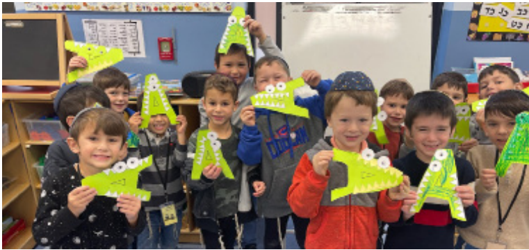
Our Pre1-A boys made an alligator teeth project for learning the letter Aa!