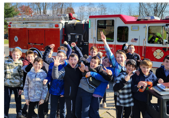
6th grade with the fire truck after the fire drill.