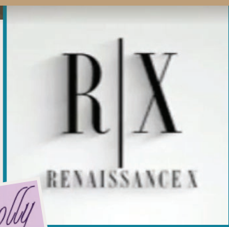
RENAISSANCE X WIG CUT BY GOLLY