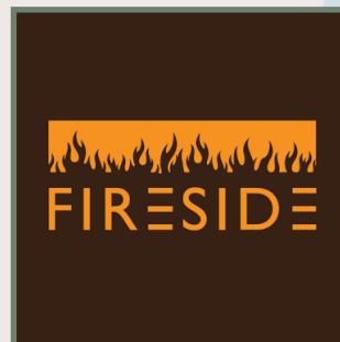
DINNER AT FIRESIDE ($250)