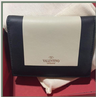
WOMEN'S VALENTINO WALLET THE REICHMANN FAMILY