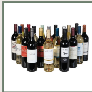
WINE PACKAGE - $500+ THE HOOK FAMILY