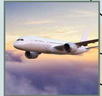
$600 TOWARDS ANY DOMESTIC AIRLINE OF YOUR CHOICE