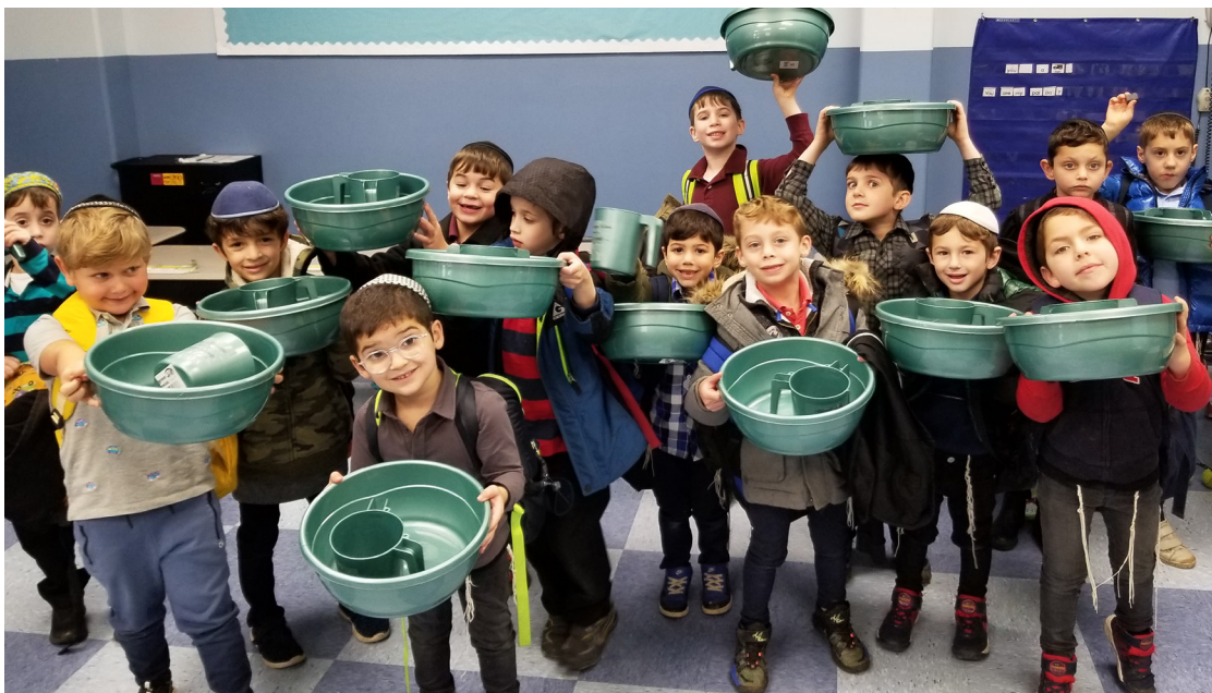
1st graders proudly holding the neigel vasser sets they received as part of the Yeshiva's school wide 'LULLAY' program - bringing simcha and awareness to the mitzvohs! Thank you to all the sponsors!