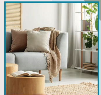
5 HRS OF INTERIOR DESIGN BY UR INTERIOR THE STERNBUCH FAMILY