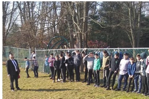
Wow! All our 8th graders lined up quietly during the fire drill.