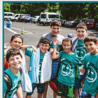
$1000 TO CAMP CHEVRA (FULL SUMMER) OR $500 (HALF SUMMER)