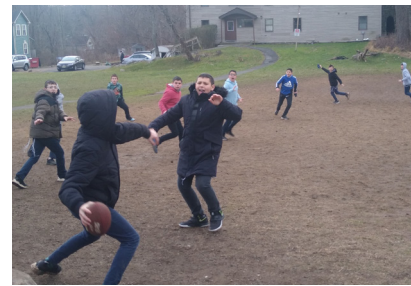
7th graders enjoying their outdoor recess.