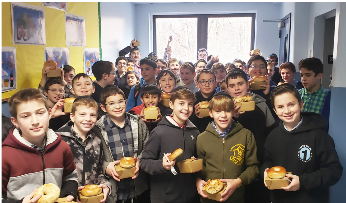
The middle schools minyan program kvod hatefillah qualifiers!

Parent Teacher Conferences - This Sunday! Please check the PTC location guide (attached) to see where your appointments will take place.