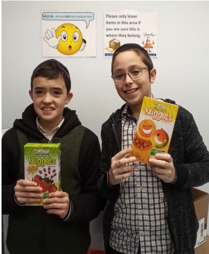
Thank you to the N'shei for sponsoring this month's Rosh Chodesh treats!