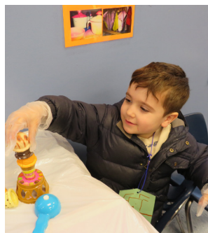
Our Kindergaren class popped popcorn ( ha'adama ) and had an ice cream store ( shehakol ) as part of their Brachos unit!