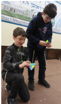
Our talmidim and Rabbeim enjoying special activities for Purim Katan!