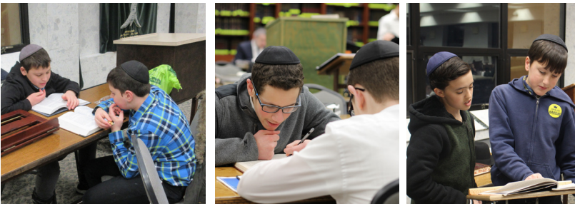
Super Seder! See flyer attached.