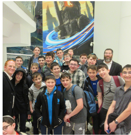
8th grade went on a trip to the American Dream Mall for davening and chazzara programs.

We encourage parents to treat their children with special items, but please - have the drink waiting for them at home when they finish school. Thank you!