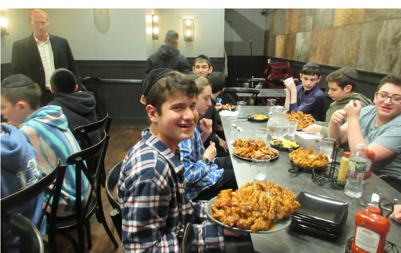
8th grade enjoying Dougies as a reward for reviewing the entire first perek of makkos over vacation!