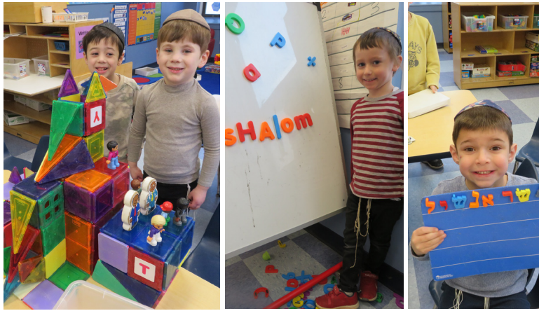
Our Pre1-A boys learning through play!

This year the boys can look forward once again to fantastic prizes as well as new and amazing class prizes! Each class will have the opportunity to experience everything from pizza parties to exciting class trips. As Purim approaches we want each and every talmid to do their best and collect on behalf of the Yeshiva in this year's campaign. WE CAN'T WAIT!