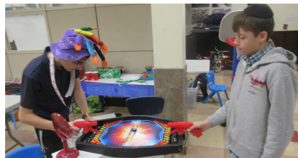
Thank you to our 8th graders for such an amazing Pre-Purim carnival!