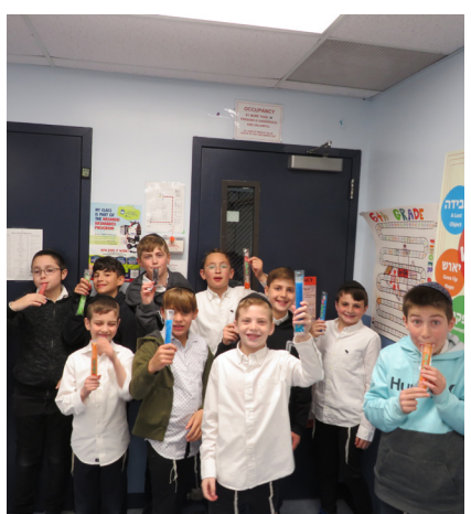
Yummy Rosh Chodesh ices!

PLEASE SHARE WITH US! Please email any Mazel Tov information to reuvenreview@ohrreuven.com!