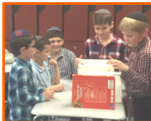
6th graders Explaining Bridge Science to First Graders