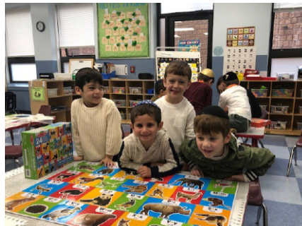
Our preschoolers learning about Parshas Noach