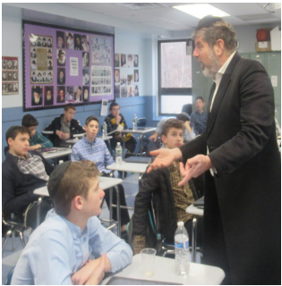
The Rosh Hayeshiva teaching 8th Graders