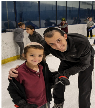
Yeshiva Ketana talmidim at Pirchei Skating this past Sunday