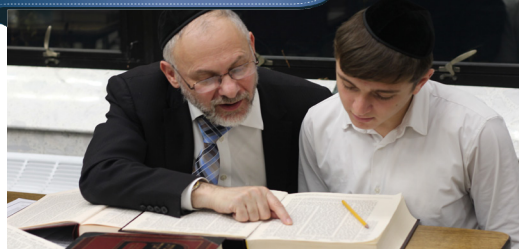
Shteiging in learning!