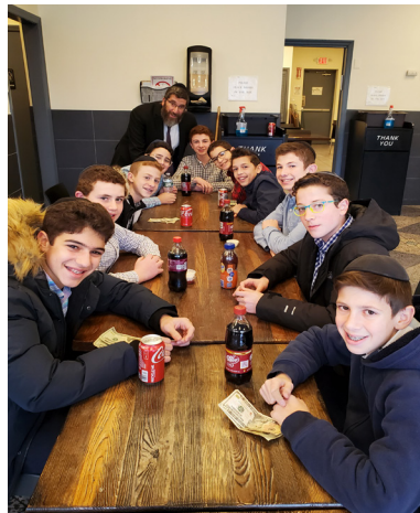
8th grade Chumash Honors Siyum in KC Grill