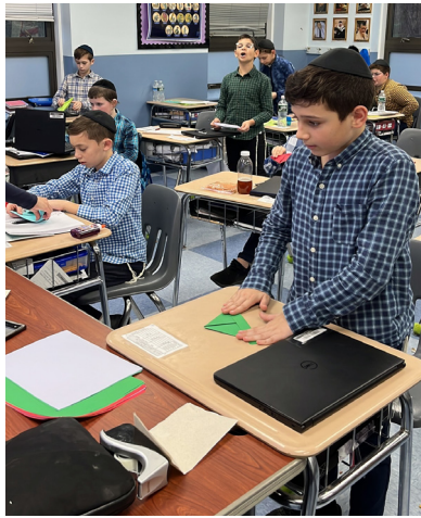
6th graders presenting their "How To" paragraph to the class