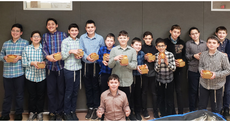
Pre-Shacharis Mishnayos Chabura siyum On Maseches Nedarim