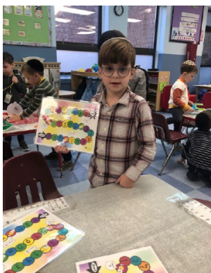
Alef-bais kria game