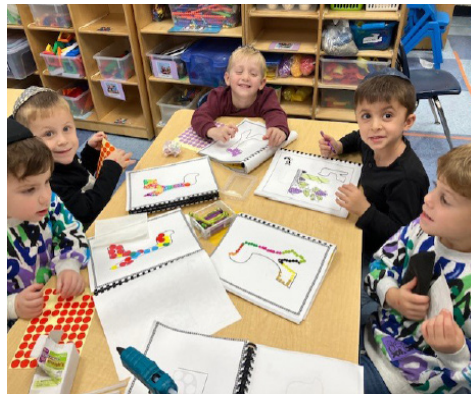
Kindergarten learning the letter Gimmel

PLEASE SHARE WITH US! Please email any Mazel Tov information to reuvenreview@ohrreuven.com !