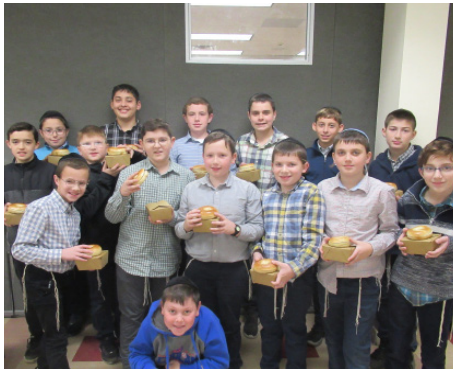
Pre-Shacharis Mishnayos Chaburah Siyum on Yevamos