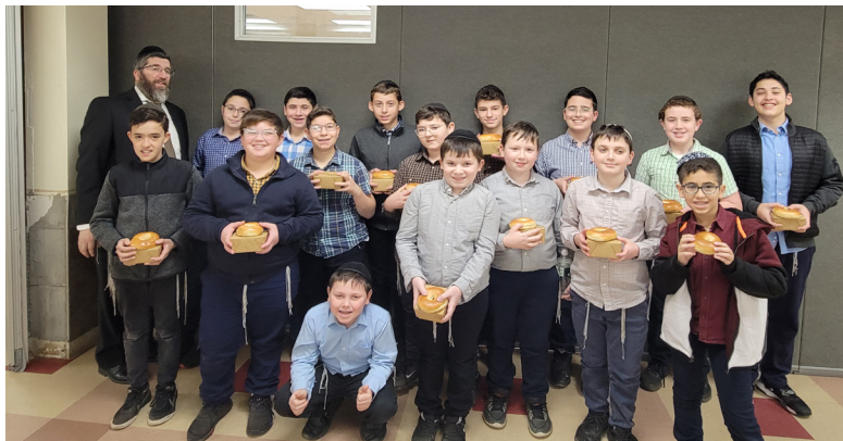
Pre-shacharis Chevra Mishnayos siyum on Meseches Nazir