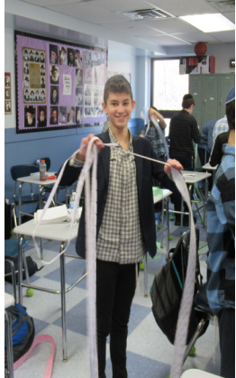
Massive 8th grade Raffle for Mastering the First Perek of Makkos